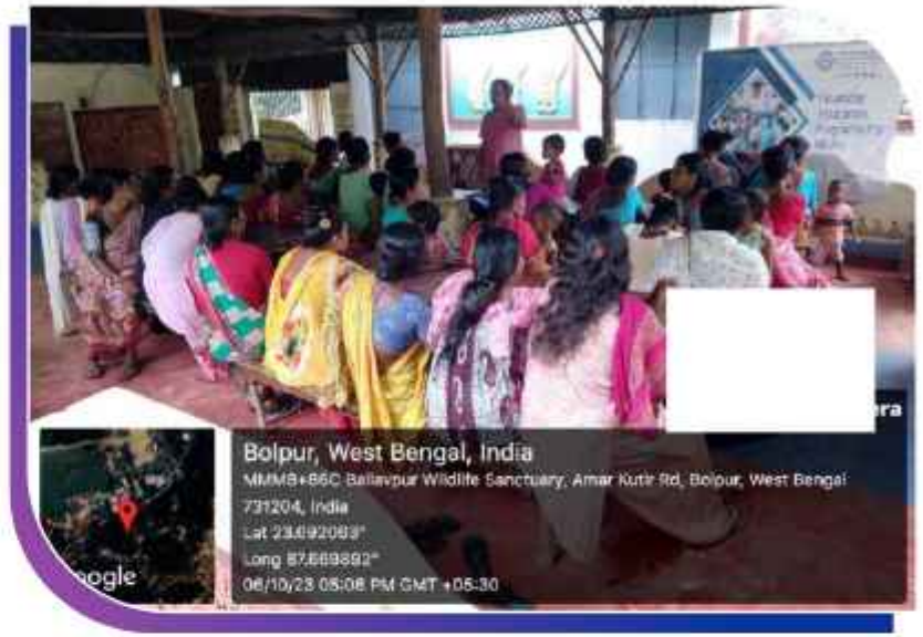
Rural Women, Bolpur - West Bengal