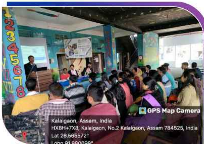
School Teachers, Kalaigaon - Assam