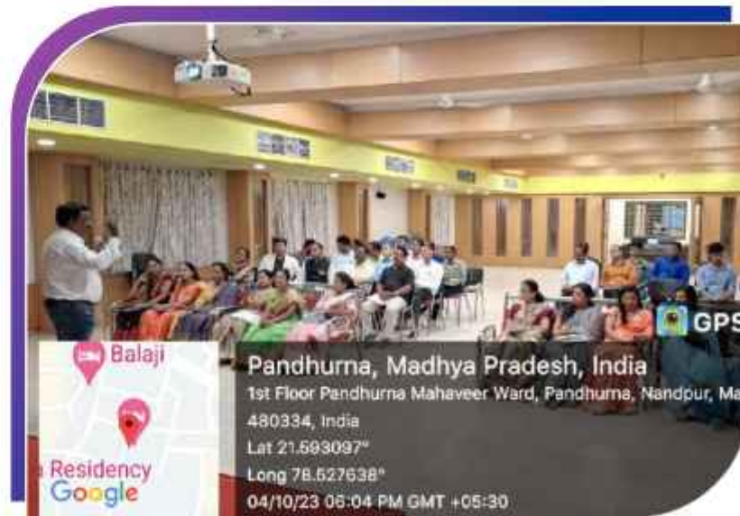
School Teachers, Pandhurna - Madhya Pradesh