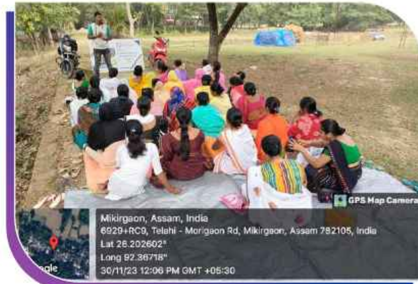
Women SHG, Mikirgaon - Assam