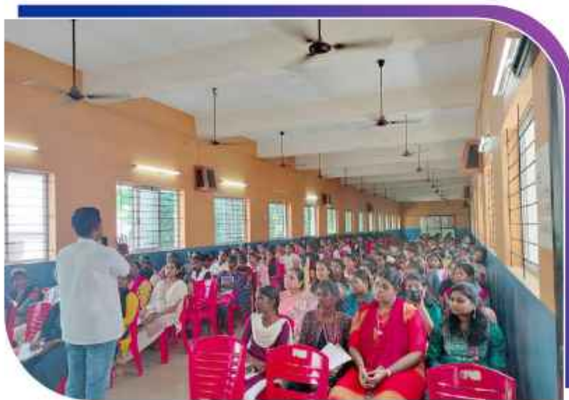
College Students, Korattur - Tamil Nadu