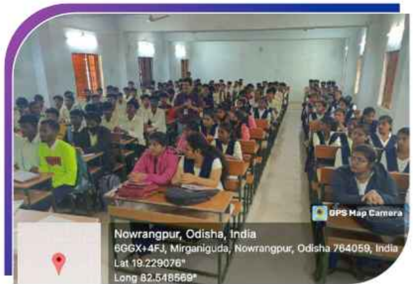
College Students, Nowrangpur - Odisha