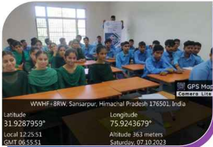
Skill Development Trainees, Sansarpur - Himachal Pradesh