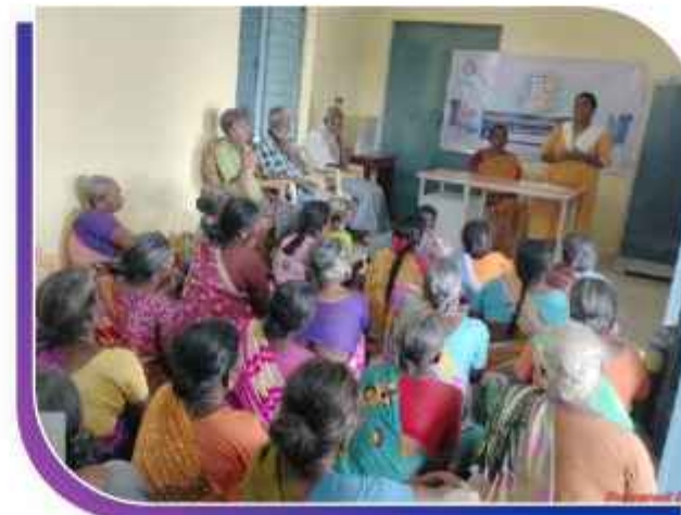
9th December 2023 Kanaiyambadi, Vellore