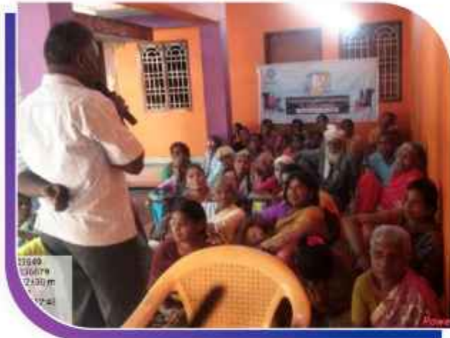
9th December 2023 Gudiyatham, Vellore