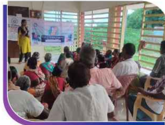
9th December 2023 Tiruchuli, Virudhunagar