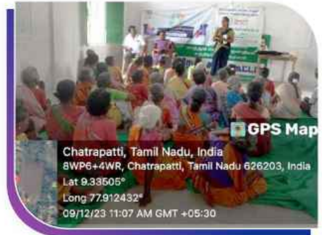
9th December 2023 Sattur, Virudhunagar