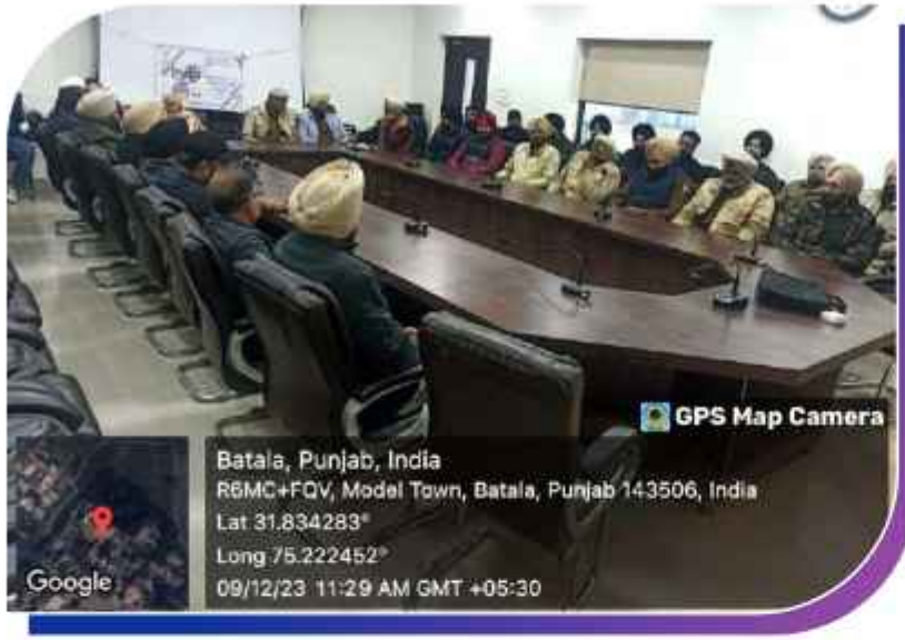
Police Personnel, Batala - Punjab