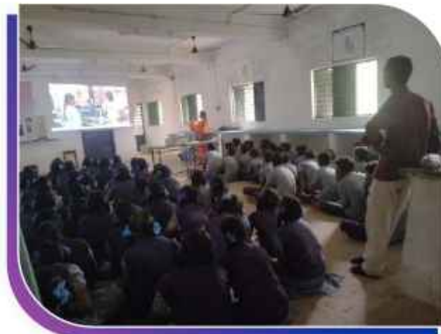
19th December 2023 Thalainayar, Nagapattinam