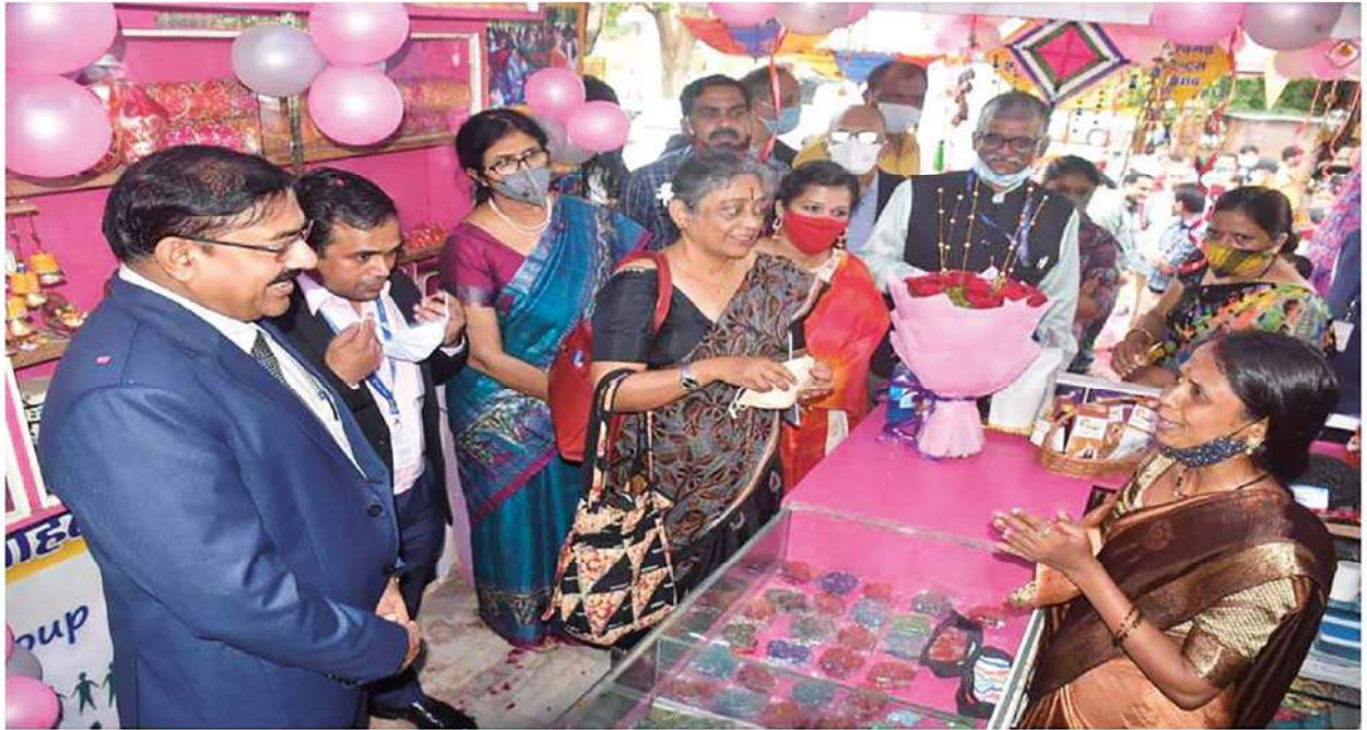
SHOP VISITED BY SHREEMAN CHAIRMAN OF NABARD AND CGM OF NABARD

थोड़े समय बाद हमने अपनी जमा पूँजी से एक दुकान खोली जिसमें हमने महिलाओं द्वारा हाथ से बनी चीजें जैसे की खाद्य सामग्री, आचार, पापड़, नमकीन, दीये, कपड़े, चादरे, कालीन, अगरबत्ती, इत्यादि बेचने लगे और थोड़े समय बाद धीरे-धीरे खरीददार मिलने लगे और हमारा सामान धीरे-धीरे बिकने लगा तथा हमारे रोजगार के लिए आवंटन राशि मदद के तौर पर मिली जिससे हमारे रोजगार को सुचारु रूप से चलाने में काफी लाभ मिला उस राशि को हमने निवेश करके दुकान में सामान बढ़ाया जो ग्राहकों की डिमांड थी।